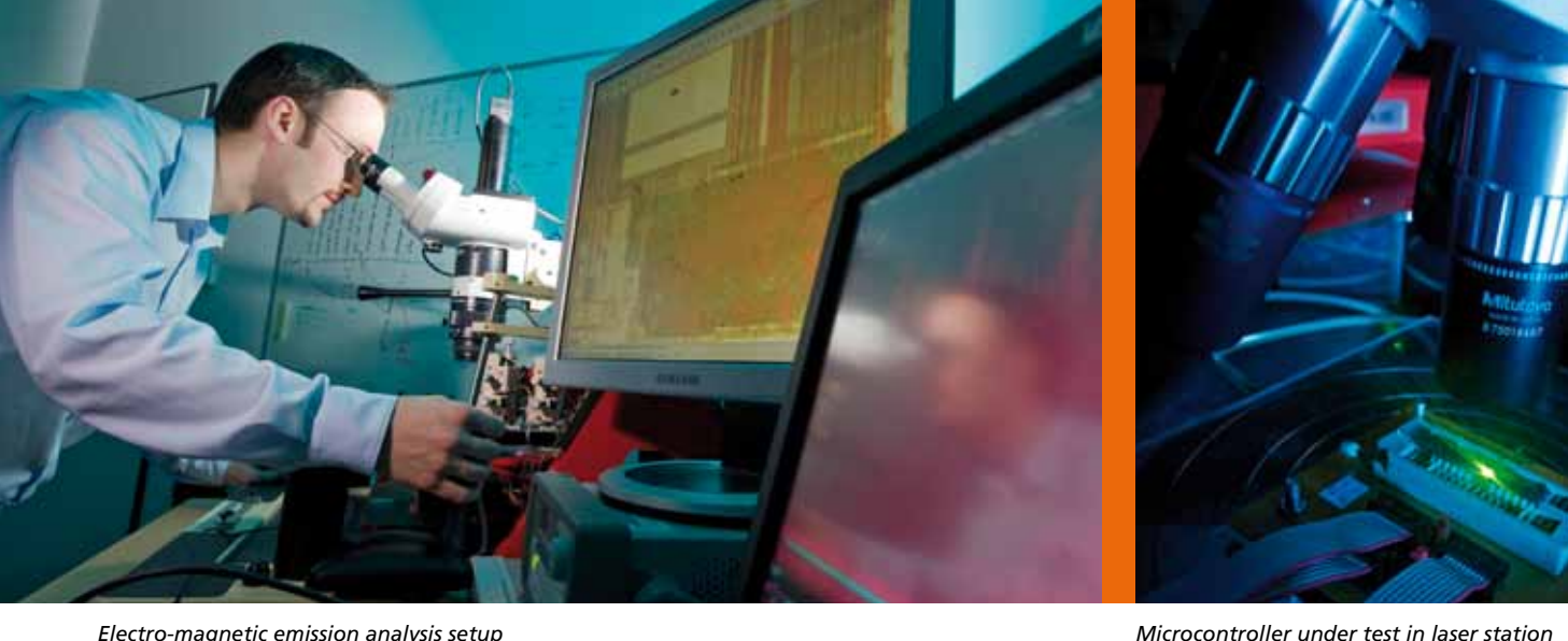
Electro-magnetic emission analysis setup

In a differential power analysis (DPA), the attacker uses statistics to analyze a system. For example, one can determine the secret key of a system by looking at a few hundred power traces. If the attacker collects several reference traces, he can compare these references with a recent power trace and thereby break the system under test within a few minutes. All the above mentioned methods are not restricted to power consumption traces, but can also be performed by analyzing electro-magnetic emission.